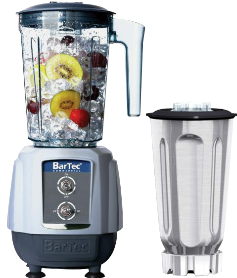
MODEL BTC-329CC (Combo Pack)